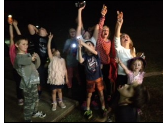
PHOTOS FROM THE NIGHT WALK