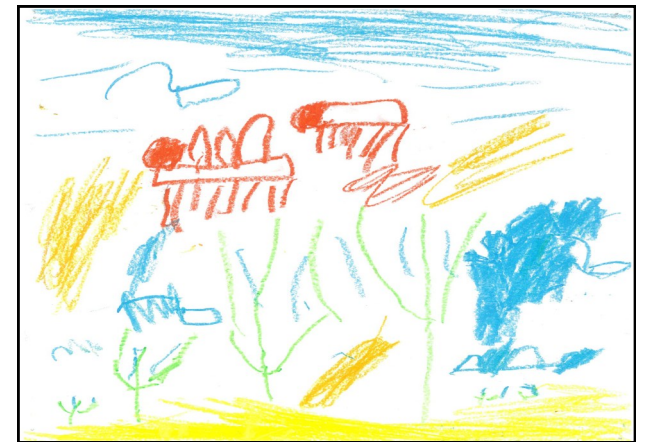
In my desert there is a lot of cacti.