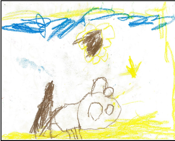
In my desert there is a bilby. BAILEY LITTLE