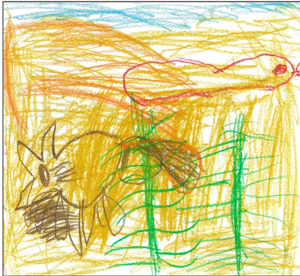
In my desert there is a snake and a bilby