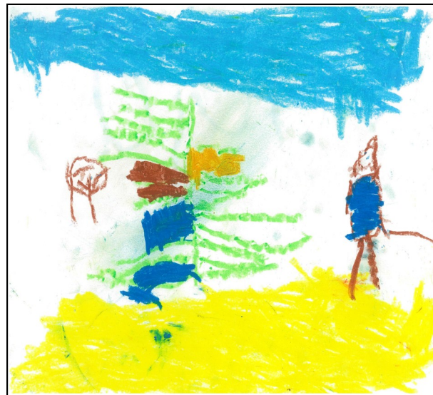
In my desert there is a mother kangaroo and a baby kangaroo.