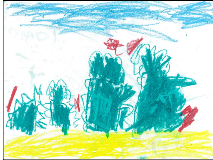
In my desert there is a cactus and fire.