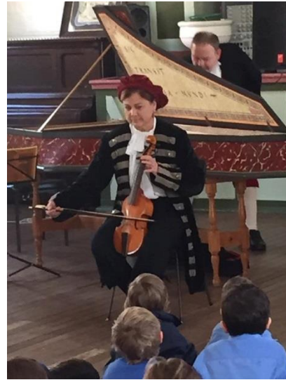
Sounds Baroque - Hercules