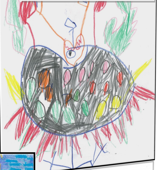
Jemma Borchard Kindergarten - 'Jake' SRC Strange Creatures challenge