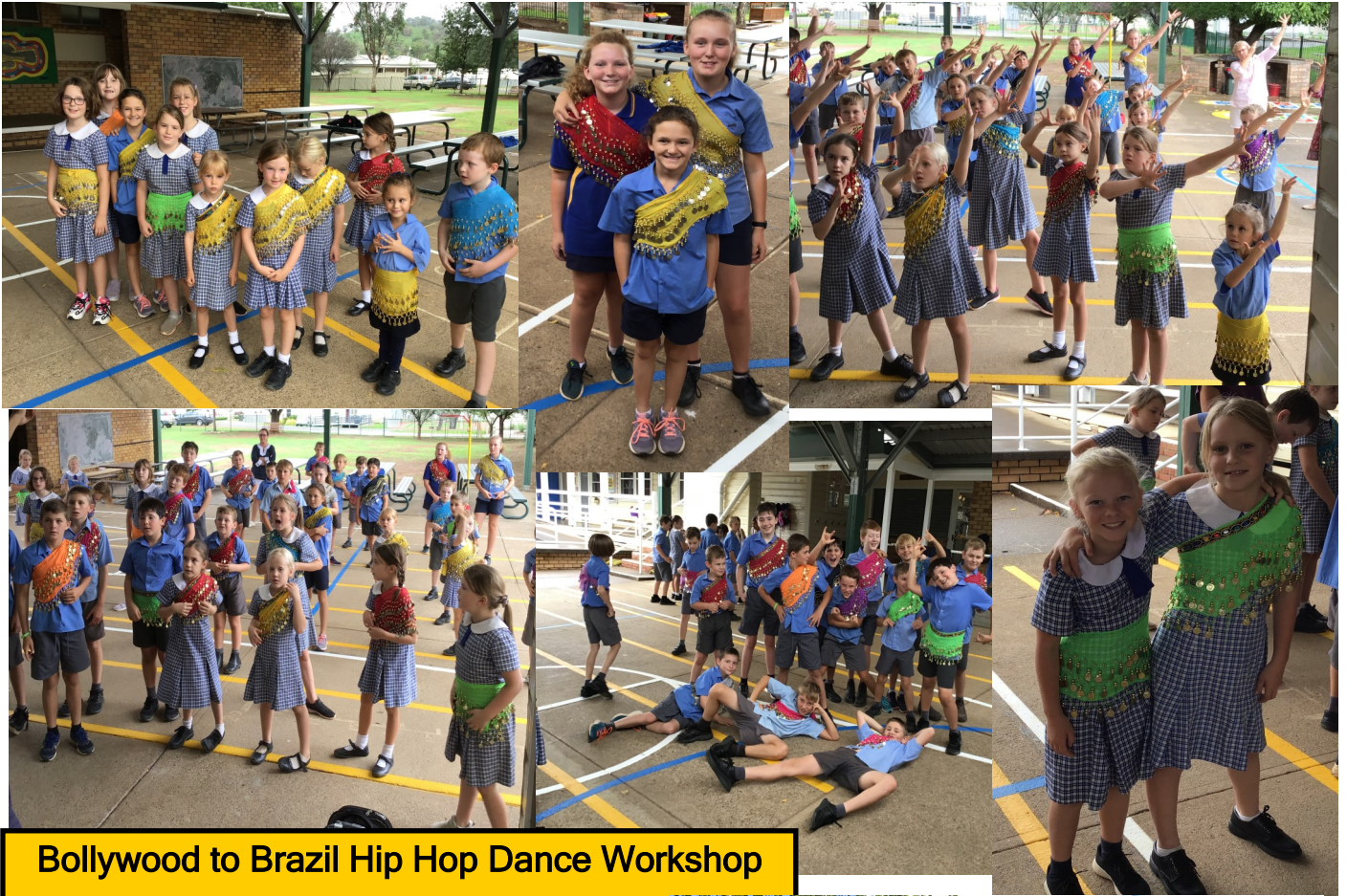
Bollywood to Brazil Hip Hop Dance Workshop