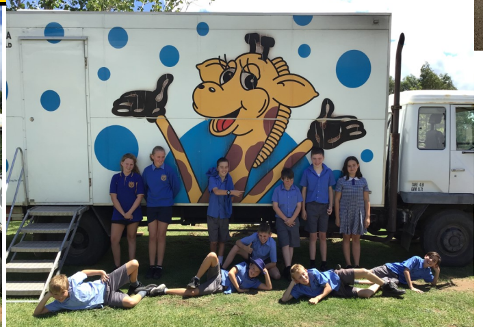
Healthy Harold School Visit