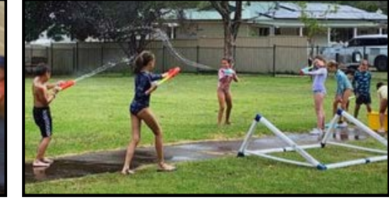
Some waterplay with the older children showing great patience with the younger children, showing and helping them how to refill their water squirters.

ty carton donations are greatly appreciate