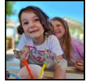
We made some pretty eggcarton flowers to take home