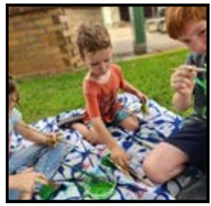
Enjoying each others company while painting frogs.