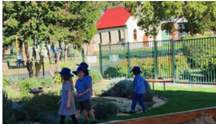
The children hunting for Easter Eggs, showing empathy and care towards each other, making sure everybody got equal amounts.