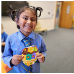
Easter Craft is always fun and enjoyable.