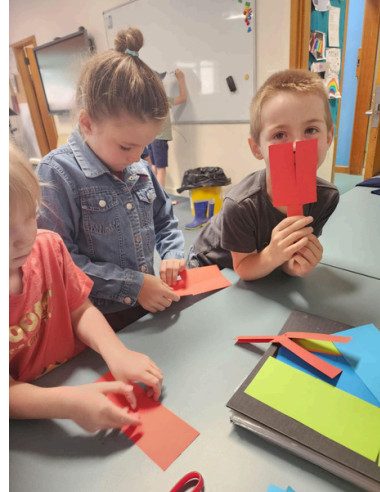
STEM activity of making helicopters with card and paperclips was a success and the children loved seeing their choppers fall and spin.