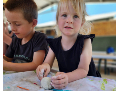
We had a lovely day outside using our imaginations to create master pieces from clay.