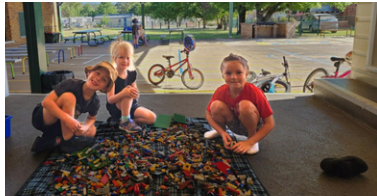
Lego is always a favourite amongst the children and encourages them to share ideas as well as lego pieces.