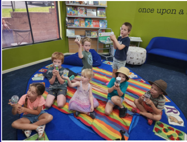
Another fun activity at the local library, we all made snowglobes to take home.