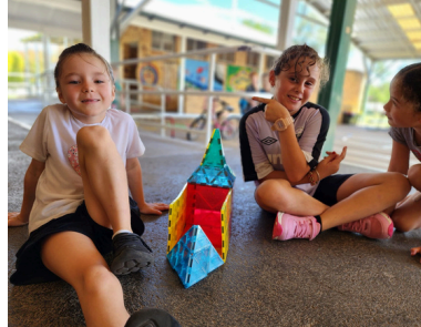
The girls enjoying each others company and proud of their collaboration on yet another masterful creation using our magnetic building pieces.