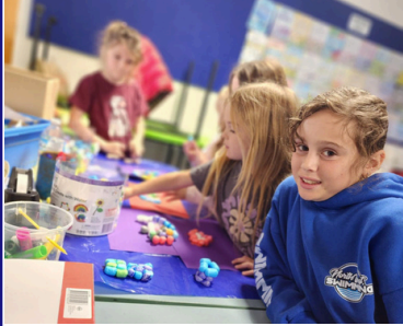
Stickle puffing is always a fun thing to do and the children come up with some wonderful ideas to make with them.