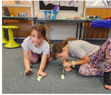
We made some caterpillars and using straws we raced them against each other.