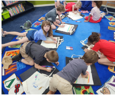
A fun morning at the local library making library bags to take home.