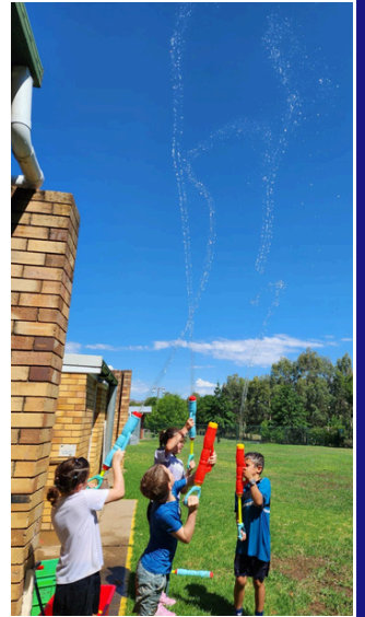
Cooling each down and having lots of laughs while doing so.