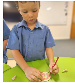
We had wooden spinning tops to decorate and play with.