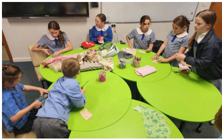
We made Fairy Houses using paddle pop sticks and scraps of material and the children enjoyed sharing ideas with each other.