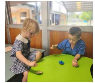
The children loved seeing how their designs looked once their tops were spinning.